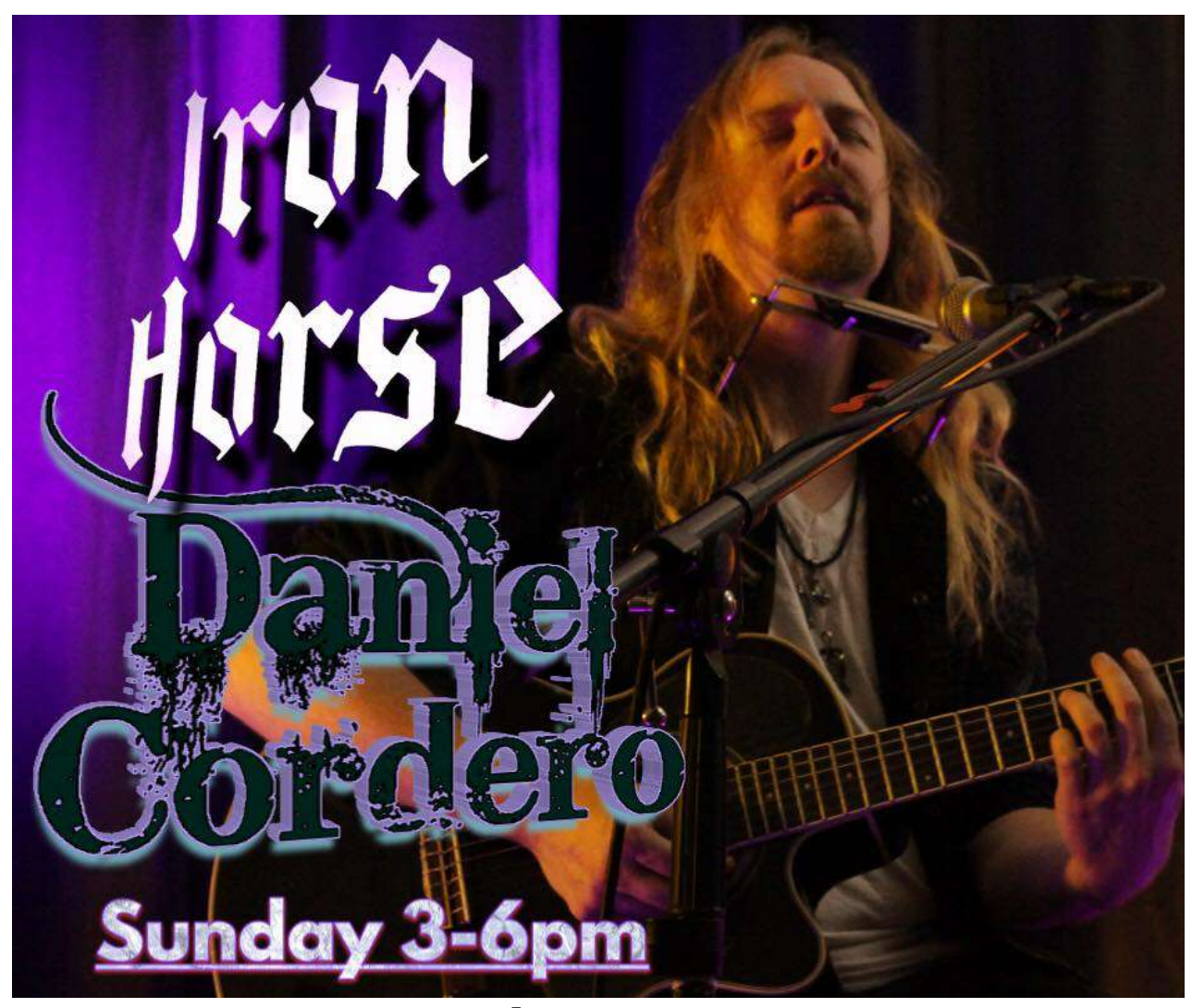
Need I say more?